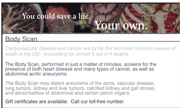
Figure 1 Excerpts from websites that offers scanning services for elective screening for disease.

benefits of many common screening procedures (1). In this Perspective series, M.G.M. Hunink and G.S. Gazelle go beyond the direct relevance of CT images for patient care to discuss the larger issues of cost, putative benefits, value of early detection, and false positive and false negative findings in general screening programs for coronary artery disease, lung cancer, colorectal cancer, and abdominal aortic aneurysms (2). These matters are raised in relation to the therapeutic advantages of medical imaging as a tool for screening. This Perspective illustrates a novel dilemma that is created when information regarding structure is offered to address questions of function: i.e., is there evidence of disease? The structure-to-function question is placed on a larger platform when it is related to healthcare-associated costs and anxiety about benign findings. It is most often assumed that a true answer to the question of whether or not there is disease will come from informed discriminations between physiological and pathophysiological conditions than from structural information alone. Thus, the Perspective by Hunink and Gazelle brings into focus the question of whether an intervention is advisable based on structural information in the absence of physiological context.